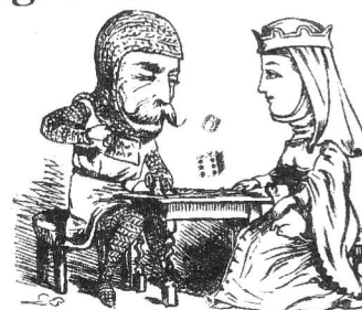
Sir Dances-A-Lot Lady Die